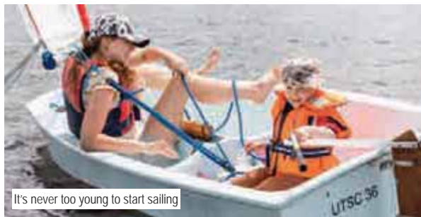
It's never too young to start sailing

At Upper Thames Sailing Club there is sailing for everyone. There is an old adage that goes something like this: 'a picture's worth a thousand words'. The following images will support that saying, and they were all taken at our club. See more images at the gallery on the club website www.utsc.org.uk/galleries