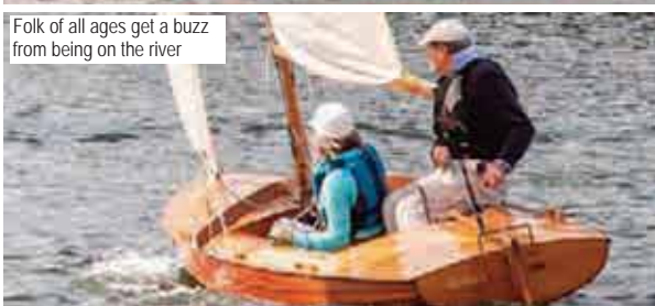
Folk of all ages get a buzz from being on the river