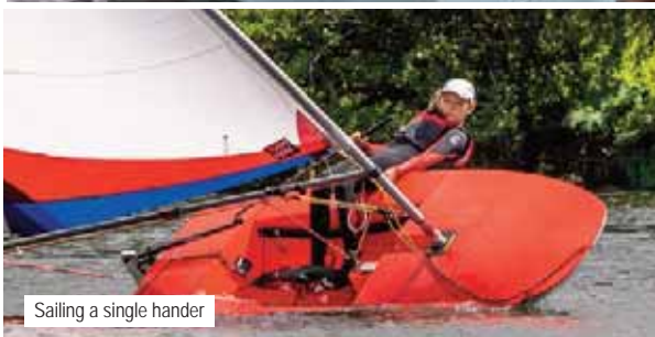
Sailing a single hander